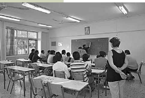
Migrants' Open School of Piraeus.

For us, this broad and multifaced solidarity movement is not only about relief, but about the way to build another world, out of the rules of profit and the market. Against the destruction (even of the remnants) of the welfare state and of social cohesion, we reply with the creation of new solidarity structures, we build social relations of a new type, new neighbourhoods, new public spaces, the moulds of a generalised social change.