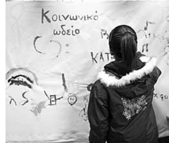
Social Music Conservatory

The development of dozens of places and alternative social spaces from autonomous citizens' initiatives, social movements and left wing and radical groups, that started more than a decade back, has created an informal network, which functioned as the hotbed for many of the ideas and practices mentioned above. Such spaces represent a new political culture of self-organisation. It embraces activities ranging from political to cultural. It connects various groups, initiatives, citizens committees etc., who use them as meeting spaces for their collective organisation and rooting in every neighbourhood. One of the most interesting projects is the Social Music Conservatory, an effort of music teachers, that started through a call in the twitter in February of 2012, for free lessons of music. Last year it functioned with 80 pupils in three different places – areas, while this year it spread to 5 spaces with 120 pupils, chosen from 1.000 children that applied, due to the lack of adequate teachers and spaces. In the Social Music Conservatory there are more than 50 teachers of music and about 30 volunteers for secretariat support, while teachers, pupils and parent participate in its assemblies. Three music groups of various music genres have been formed and facilitate solidarity music events in support of other solidarity initiatives.