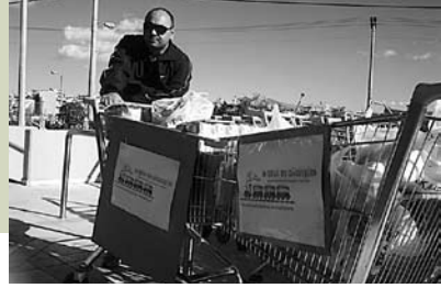
Collection of food donations outside a super market from the "solidarity's train" (Athens)