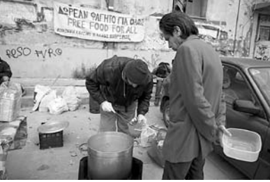
Social soup kitchen from the collective "the other man".