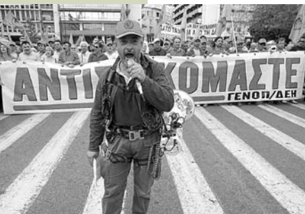
The public power company's trade union at a general strike, 2011.