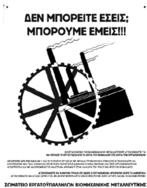
Poster of the recuperated and refashioning under workers control factory of the "Industrial Metal Co" (2012).

them as a tool of organisation and resistance against the crisis, integrating them in the development of solidarity structures in the neighbourhoods, defending public spaces etc. Side by side to those, there is a series of co-operatives , from coffee shops and taverns, courier delivery companies and computer repair-shops to bookshops and agricultural co-operatives of unemployed women. These actual paradigms have contributed immensely to spreading the idea and the practices of socialised and self-managed forms of employment and solidarity economy. Up to November of 2012, 93 social enterprises have submitted their papers to register in the record of Ministry