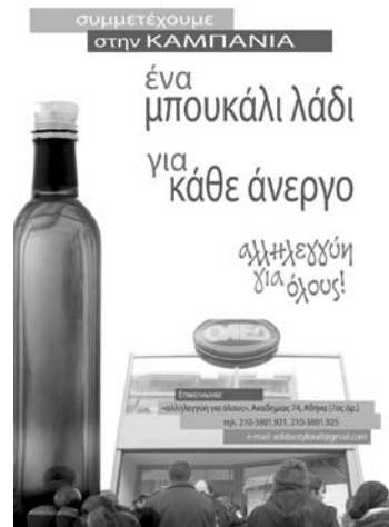
Poster of the “Solidarity for All” initiative: A bottle of olive-oil for each unemployed”

“Solidarity for All” has the ambition to become one more pebble in the struggle for a life without austerity memoranda, poverty, exploitation, fascism and racism, striving to create the conditions for a radical policy for the overthrowing of the current regime and for social transformation.