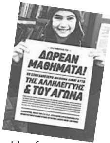
Social Supporting Classes, in the town of Nafaktos

Initiatives taken by unionised and unemployed teachers, by Associations of pupils' parents, and by volunteer students, have set up solidarity lessons and social evening classes for educational support of children coming from families that cannot afford the high fees of private auxilliary schools. Many of the social evening classes are organised through the common assembly of teachers, parents and pupils, while they stress that they don't aim at a substitution of the ailing public education, but at confronting the inequalities of an educational system that is shrinking and is dissolving under the policies of austerity, which sharpen class distinctions and compromises the opportunities for the children of the lower classes. The Solidarity School of Nikaia, one of the poor-