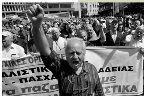
Pensioners demonstrate against pension-cut, 2009.

Additionally, since 2012, according to memorandum II, the basic monthly wage (gross) decreased by an additional 22%, from 751€ to 586 for those over 25 years old, while for those under 25 it declined by 32%, going from 751€ to 511€, that is the net wages fell to 427€ 10 , with the real fall of salaries in 2012 to be calculated to 30%. Thus, with the hour remuneration to fall to 2,7€, formally the wages turned back in the levels of 2005, while the real purchasing power of the average wages receded in the levels of 2003 and of the lower wage fell to the level of the 1970's.