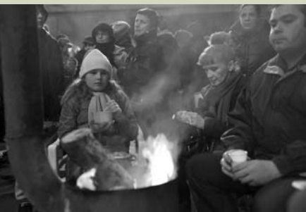
Solidarity NYE (2012) party outside the gates of the Hellenic Chalivourgia factory in support of thr months' long strike of the steelworkers.