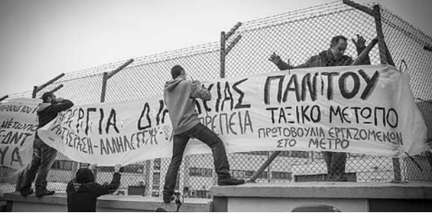
Strikers at the METRO train depot during the recent 8 days strike by the transport unions which ended with a court injunction, 2013.

in the levelling of the social security system and of the pensions in Greece.